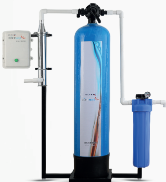
Zoftnor Max W1