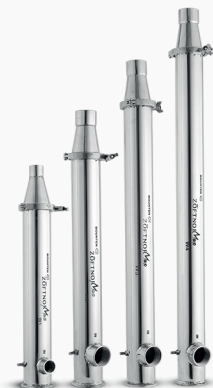
W1, W2, W3, W4