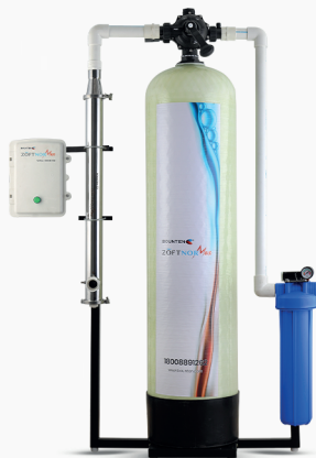
Zoftnor Max W4